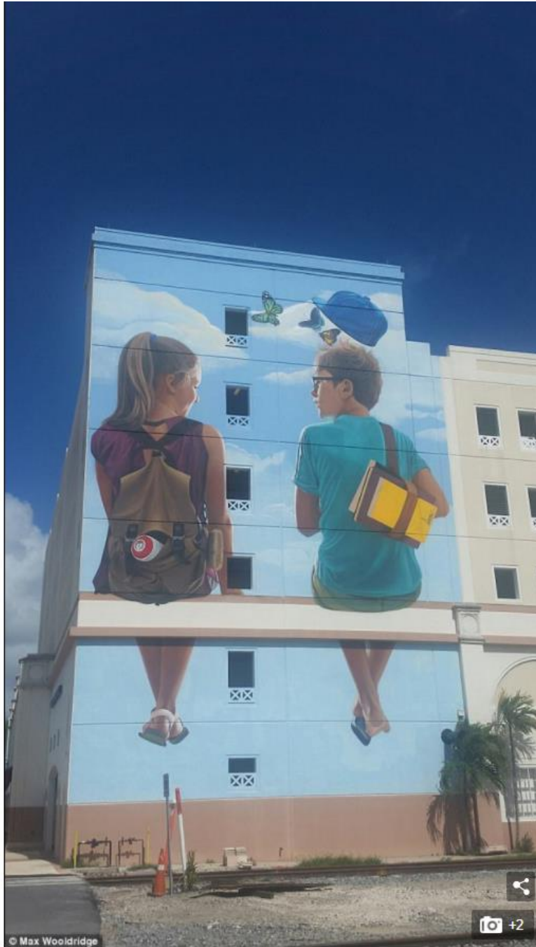
Artsy: In West Palm Beach, there are funky diners, cool cafes and huge street murals to behold

'The city of Miami might easily have been called Flagler City instead. But Flagler Vice just doesn't have the same ring to it,' he adds with a smile, referring to the hit TV crime series Miami Vice.